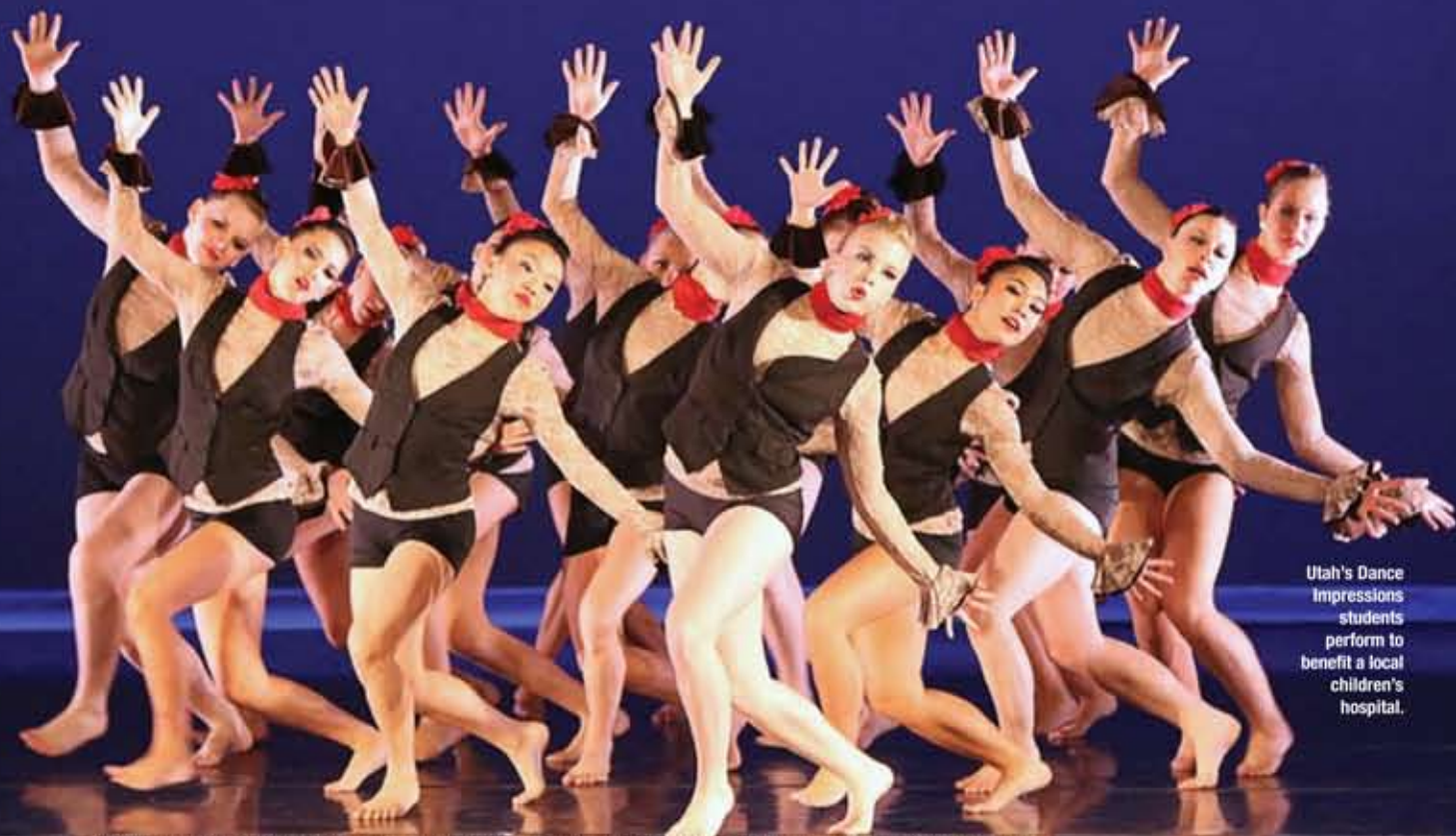
Utah's Dance Impressions students perform to benefit a local children's hospital.

AS SEEN IN DANCE TEACHER MAGAZINE. UNAUTHORIZED DUPLICATION IS PROHIBITED.